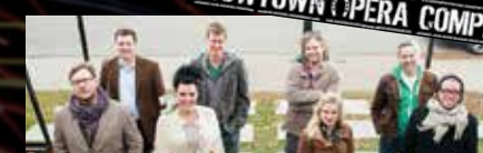
COWTOWN OPERA COMPANY

Note: Program and artists subject to change without notice.